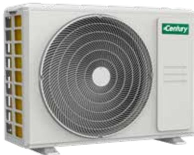
12,000 & 18,000 BTUH

1 Oil traps must be installed every 10 feet when outdoor unit is installed above indoor unit.