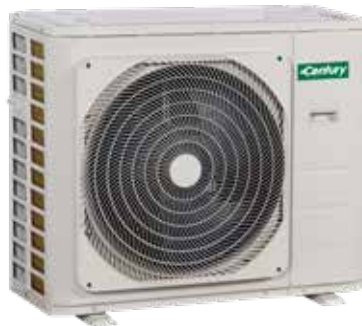
24,000, 30,000, 36,000 BTUH